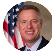
Congressman Scott Peters 52nd Congressional District